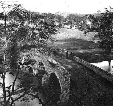
An excellent view of the famous "Burnside Bridge" over Antietam Creek from Confederate viewpoint.