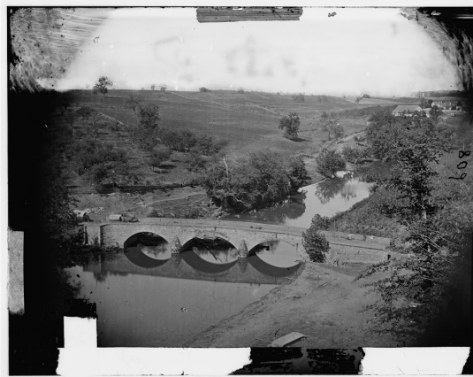
Another view of bridge at the Battle of Sharpsburg. The Bridge was the scene of fierce fighting as the Union tried to cross Antietam Creek.