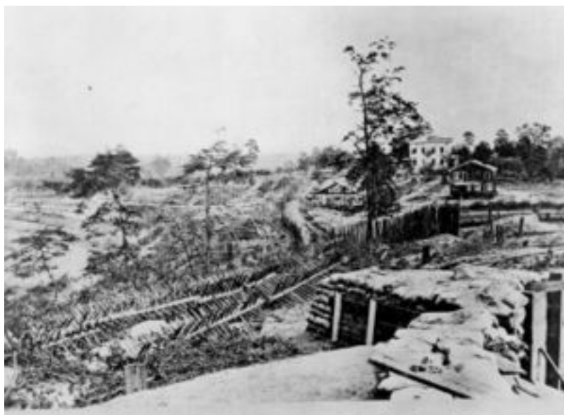
Potter House—Battle for Atlanta—July 22, 1864