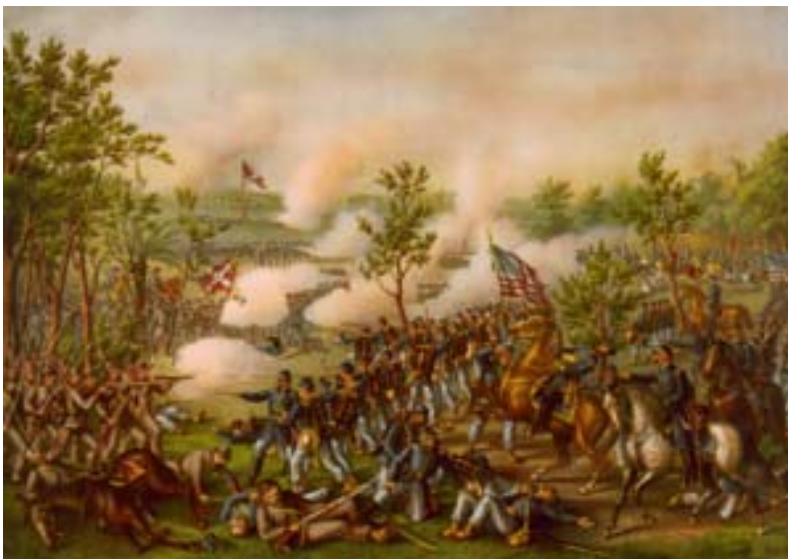
Battle for Atlanta—July 22, 1864