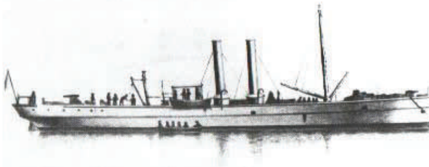
CONFEDERATE STATE STEAMER TALLAHASSEE VISITS HALIFAX AUGUST, 1864